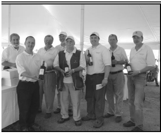
Your Shoot Committee