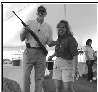
Lucky Pellet Winner