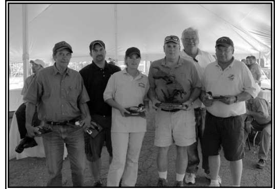
Canale Electric – Our 2007 Winners

Consistent with the Hunting Heritage Trust’s mission of “ Giving Back ”-- we are again inviting our shooters to visit their attics, closets and gun safes in search of new or used quality items for our raffle or auction. Over the past three years, items donated by our shooters have generated nearly $15,000 for the Hunting Heritage Trust – and $15,000 worth of tax-deductions for our donors.